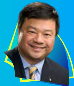
Leroy Chiao, MD

Dr. Leroy Chiao, a former commander of the International Space Station and one of the first astronauts to use and study ultrasound in space, will explore the dual advancements in operational countermeasures and diagnostic ultrasound for spaceflight and how these innovations translate into healthcare solutions on Earth.